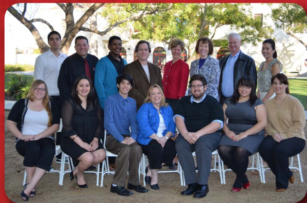
2011-12 ASI Board of Directors